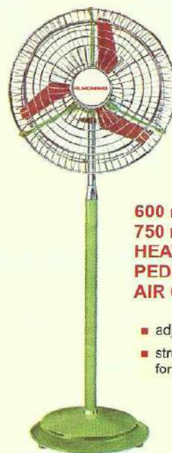
600 mm (24") 750 mm (30") HEAVY DUTY PEDESTAL AIR CIRCULATOR