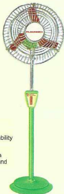
TEMPEST 450 mm (18") PEDESTAL AIR CIRCULATOR